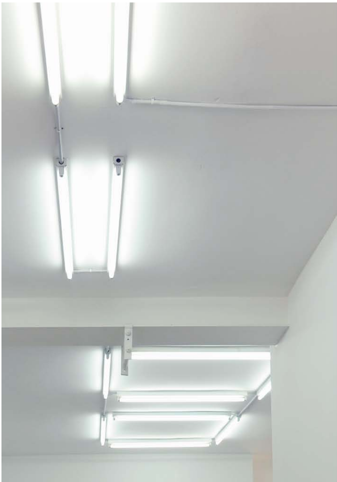
before the exhibition.