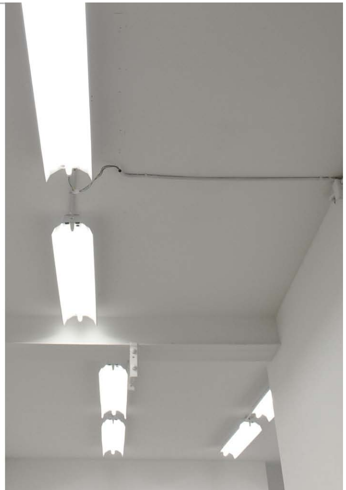
during the exhibition.