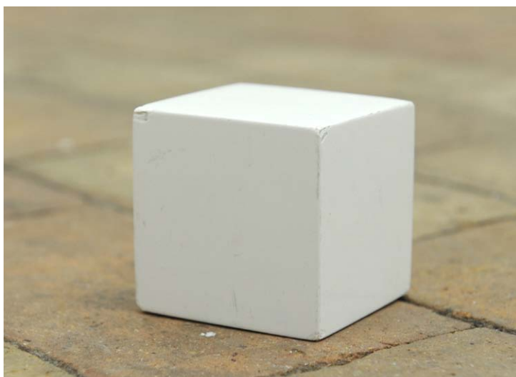
cube in the gallery.