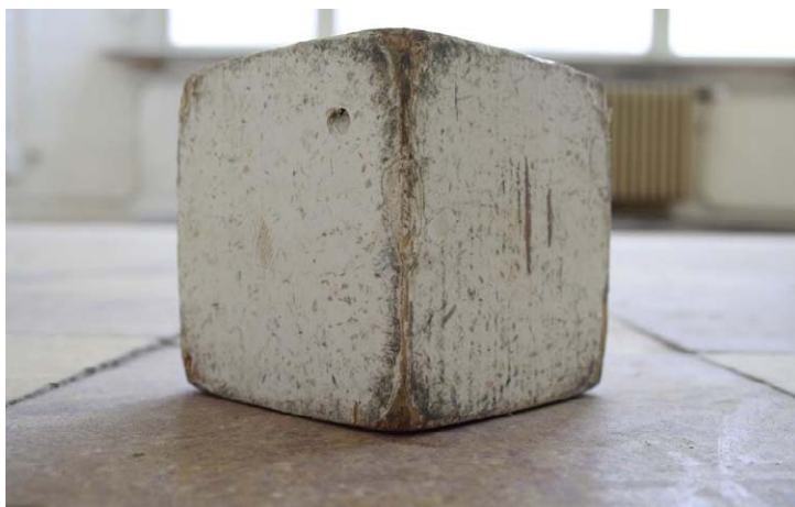
cube in the artist's studio.